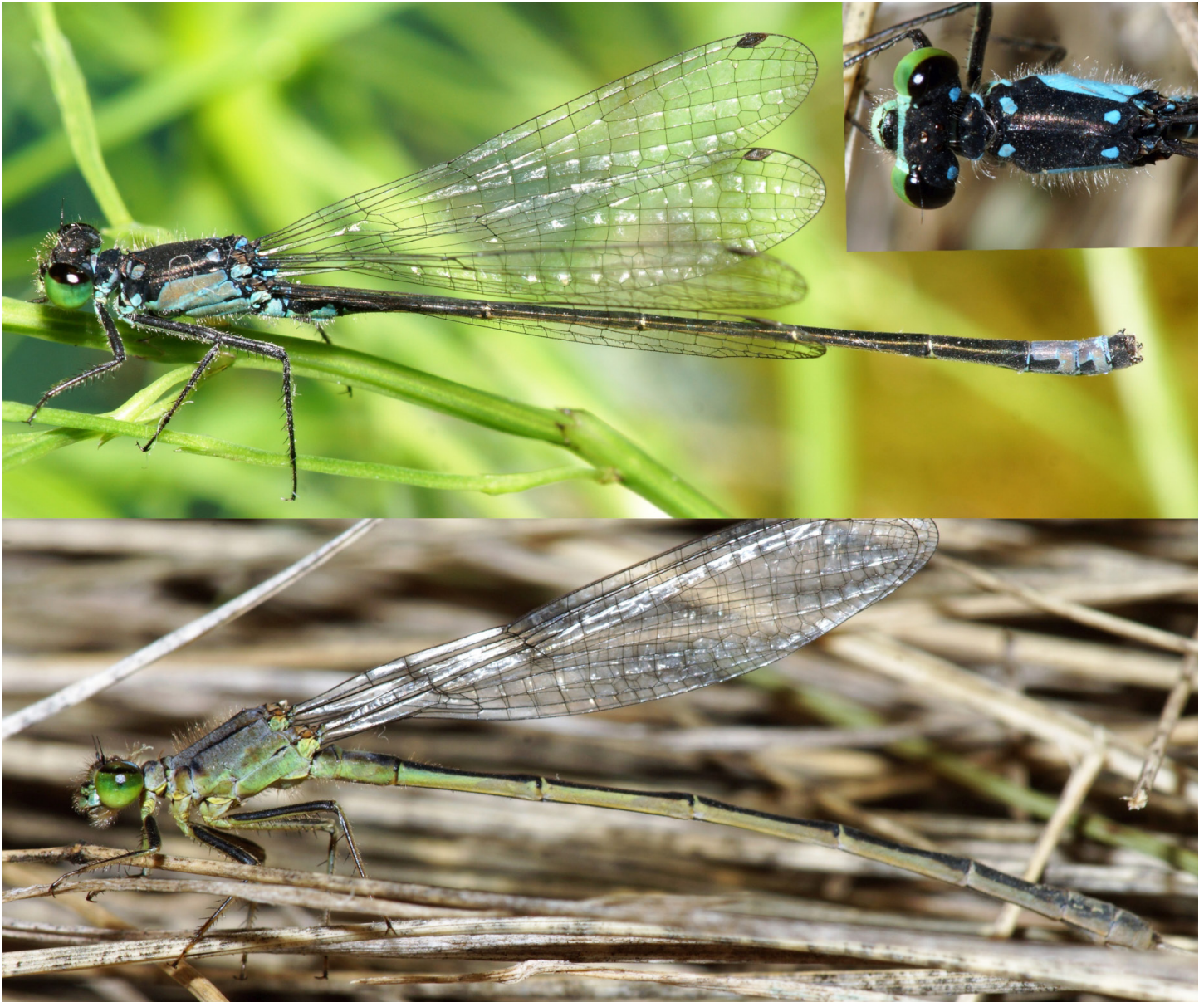
Figure 1. Composite photograph of male Pacific Forktail - September 2022 (top), female Pacific Forktail - July 2021 (bottom) and inset showing the reduced male antihumeral stripes.

of emergent vegetation consisting of cattails and bulrushes ( Scirpus spp. ). Based on my previous surveys, the slough has moderate fluctuations in water levels, with some portions of it drying out. More recently, storm sewer inflow has provided a source of water.