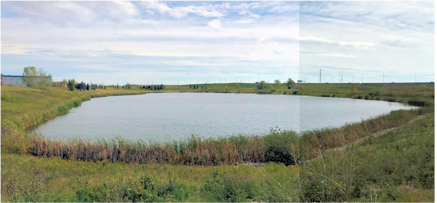
Figure 4. Panoramic photograph of the storm water pond looking east from the gravel road. Note band of cattails forming a thin band around the edge.

within the general western Canada range of March to September (Paulson 2009). The emergence dates at a specific locality vary due to local weather, water, and other related habitat conditions. While the elongate slough falls within the expected habitats, the storm water drainage pond is an interesting addition to these environments. The potential mimicking of natural spring-like hydrology from the underground flow of storm water into this pond may be one factor attracting Pacific Forktails. The water salinity and pH fall within the expected characteristics reported by other authors. Water salinity ranged from 385 to 1130 ppm, categorizing it as fresh to slightly saline (USGS.gov). The pH of 8.52 also falls within the reported range of neutral to alkaline. Finally, the presence of Pacific Forktails in Calgary, Alberta marks a significant range expansion of the species out of montane environments in Alberta and British Columbia into the prairie grasslands.