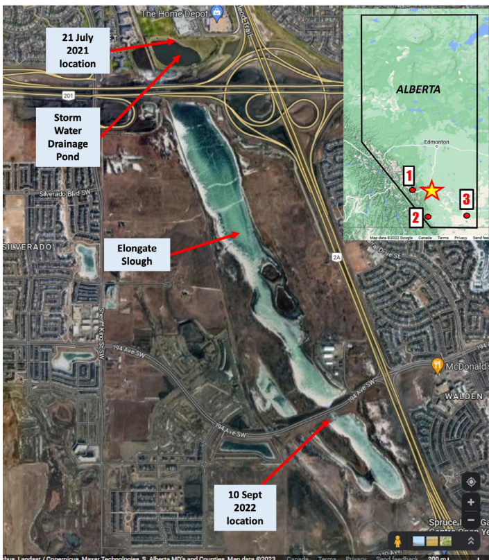
Figure 3. The inset map shows the locations of the three known localities of Pacific Forktails in Alberta: 1) Banff, 2) Crowsnest Pass, and 3) Cypress Hills. The new location in Calgary is indicated by the yellow star on inset map. The larger map shows the location of the storm water drainage pond and elongate slough. The location of the 2021 and 2022 encounters are also marked on the map.

of the original sighting. The individual was collected and photographed to confirm its identification. Additional damselfly species known from this site, based on previous surveys that I conducted in 2021 and 2022 are: Coenagrion angulatum (Prairie Bluet) and Lestes congener .