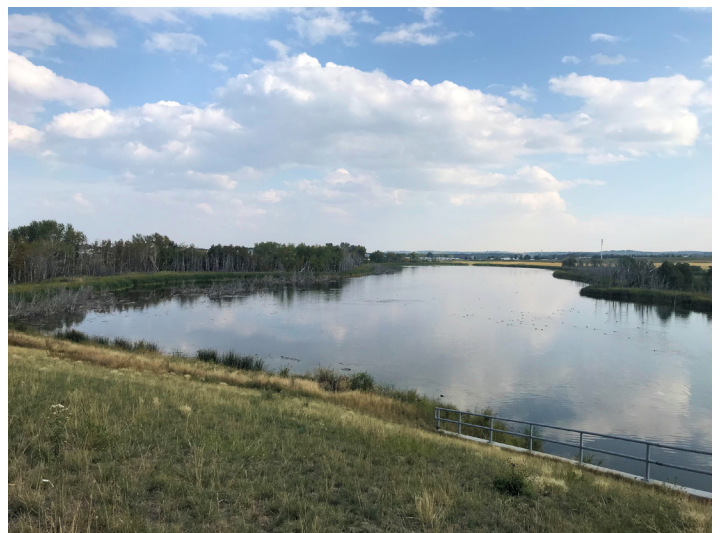
Figure 5. View of the elongate slough looking south from the road cutting across it 2.8 km south of Somerset Pond. Distance to the south end of slough is about 700m.